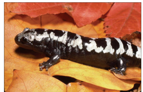
Marbled salamander ( Ambystoma opacum ), a vernal pool indicator species

Vernal pool habitats were recognized as requiring Level I (highest priority) conservation actions in the PA-WAP (Chapter 17-5). They are threatened by filling, excavation, and forest fragmentation, as well as alteration of hydrology, water chemistry, substrate, vegetative cover, and conversion of natural habitat for human uses. Vernal pools are particularly vulnerable to destruction because they are easily overlooked during their dry phase.