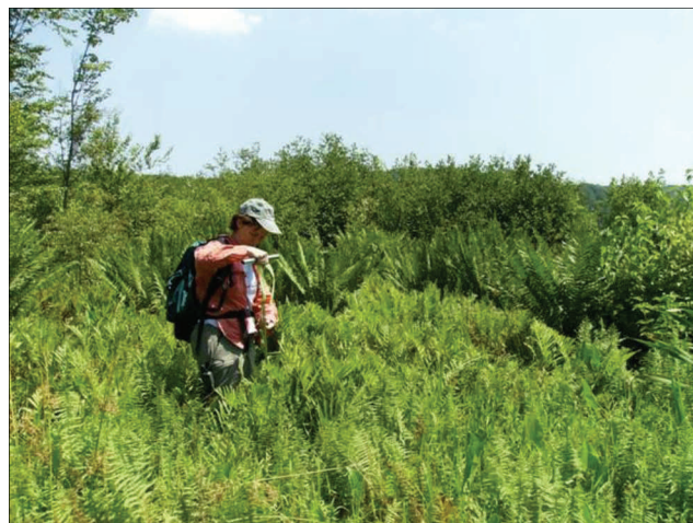
Sally Ray soil sampling at State Game Lands 111 in Somerset County

Wet thickets serve as habitat for priority bird species included in Pennsylvania's State Wildlife Action Plan (WAP), however, little is known about the composition and distribution of this habitat type. PNHP staff are identifying what bird species use wet thicket habitats (with a focus on WAP species), and examining the plant composition of these habitat types across Pennsylvania. During the first quarter of 2011, we submitted the final report for the State Wildlife Grant to the Pennsylvania Game Commission for review. In addition, we analyzed vegetation data for new plant community types and began writing the final report for the Wild Resource Conservation Program grant, which will be completed by June 30, 2011. Based on analysis of vegetation data, two additional palustrine shrubland community types were identified. Descriptions for these types were written and presented to the Pennsylvania Biological Survey (PABS) committee for expert review and discussion. It was agreed that these new types would be added to the already existing palustrine shrubland types identified in the Terrestrial and Palustrine Plant Communities of Pennsylvania (Fike 1999).