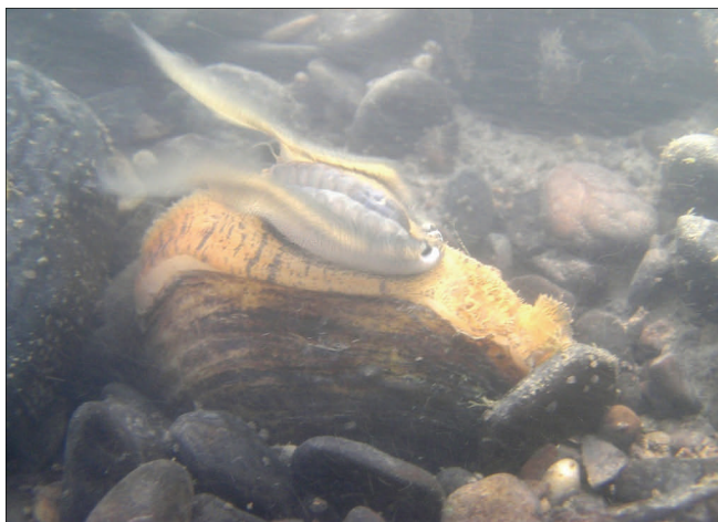
A displaying plain pocketbook ( Lampsilis cardium ) found in Conewango Creek

In 2010, PNHP staff conducted mussel surveys of Conewango Creek. This Allegheny River tributary has a large mussel population with a unique community composition that includes the federally listed northern riffleshell and the plain pocketbook shown below displaying its reproductive lure. The final report for this State Wildlife Grant project was completed and submitted in the first quarter of 2011.